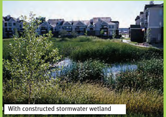
With constructed stormwater wetland

A visual-impact analysis tool for public meetings and documents.