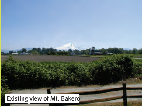
Existing view of Mt. Baker

A planning tool to present alternatives and solicit feedback.