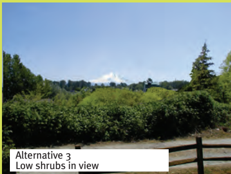
Alternative 3 Low shrubs in view