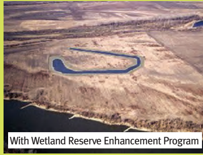
With Wetland Reserve Enhancement Program

An informational tool to illustrate conservation programs and activities.