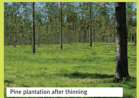
Pine plantation after thinning