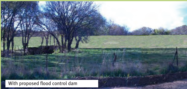
With proposed flood control dam

A training aid to help convey management concepts.