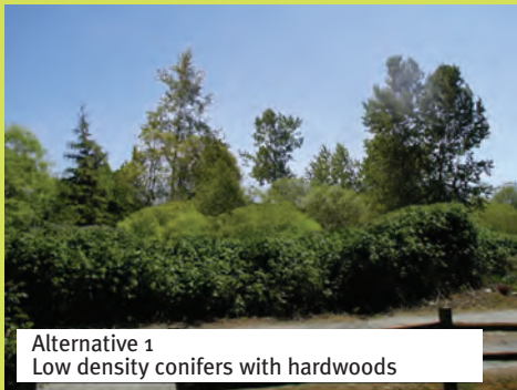
Alternative 1 Low density conifers with hardwoods