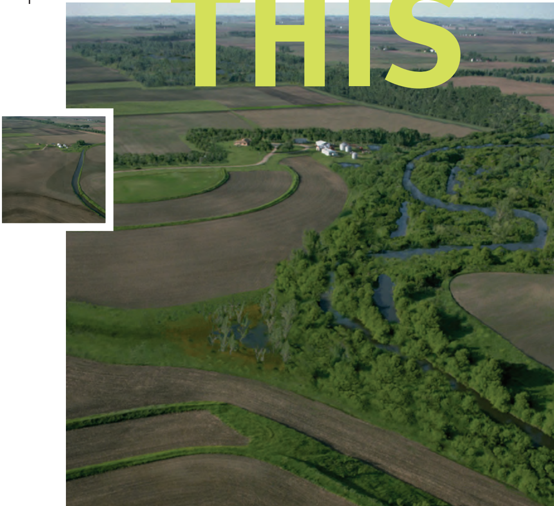
A visual simulation of a proposed stream corridor restoration project.