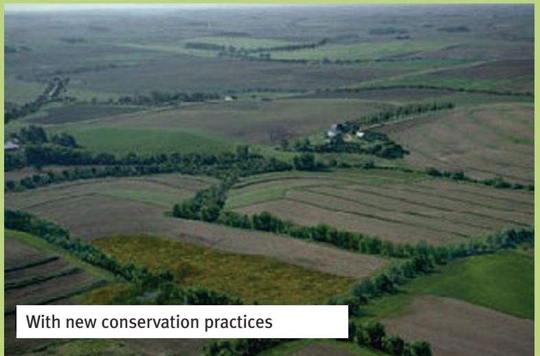
With new conservation practices