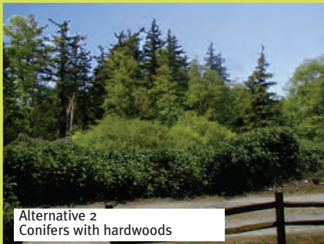
Alternative 2 Conifers with hardwoods