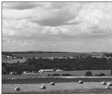
Agroforestry enterprises diversify the landscape and the rural economy.

Indeed, agroforestry practices are perceived as economically, socially, and environmentally beneficial, all key aspects of the sustainable development Atlantic Canada is pursuing. But it is difficult to know where to begin, as work is needed at various levels.