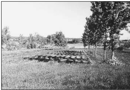
Studying the interactions of trees and crops at the University of Guelph research site supports the adoption of intercropping agroforestry.