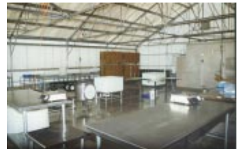
The new packing shed's interior shows the attention to detail that make it certifiable as a processing plant.

As a result of those guidelines, which include recommendations of certain procedures for growing sprouts that, according to California Certified Organic Farmers and the California State Organic Program, do not conform to organic standards, the partners shifted their plans for