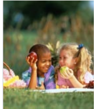
The "Marketing Equals the Four Ps" fact sheet identifies methods that help you define your target market, which may include families with young children.

Each fact sheet is free and available online at http://www.sfc.ucdavis.edu/agritourism/factsheets.html or by calling the Small Farm Center at (530) 752-8136 or e-mailing sfcenter@ucdavis.edu ■