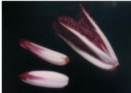
Red endive.

Propagation and care. Endive is similar to lettuce in its soil and climatic requirements. Plant 1 foot apart in rows spaced 1 1/2 or 2 feet apart. Blanching the head for two weeks will reduce bitterness. To blanch, tie the head like cauliflower or stand boards on each side of the row. Tie the leaves together only when they are dry, since wet foliage during blanching will decay. Blanching is not a common practice among commercial growers.