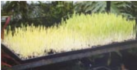
These white corn greens, grown and sold by New Natives, are part of an emerging cuisine called “white foods.”