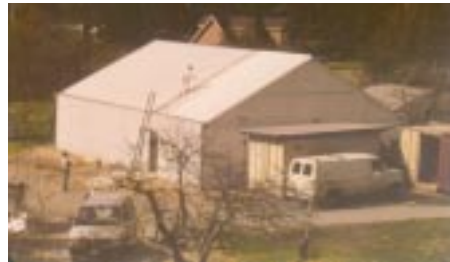
The new packing shed nears completion at New Natives farm.

Suslow has compiled food safety information on a free CD (see Resources section for ordering information), which Kimes recommends to growers for its food safety checklists. Kimes also suggests visiting the Primus Labs web site for additional free checklists at http://www.primuslabs.com/fs/self.html .