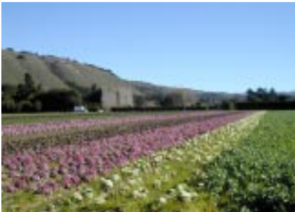
Vegetable crops like these growing in California's Carmel Valley are excluded from farm subsidies.