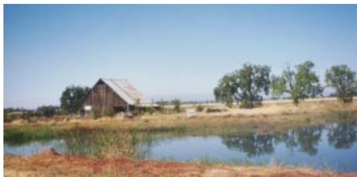
Americans value farmland not only for the food it produces, but also for the habitat it provides for wildlife such as pheasants, ducks and other animals.

The Senate is now beginning consideration of a bill under the leadership of