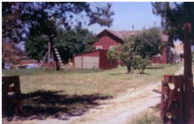
Scenic farm vistas such as this one are valued by three quarters of the Americans who responded to the American Farmland Trust poll.

House bill did some of this, but mainly increased money for the traditional major commodities. A bipartisan amendment