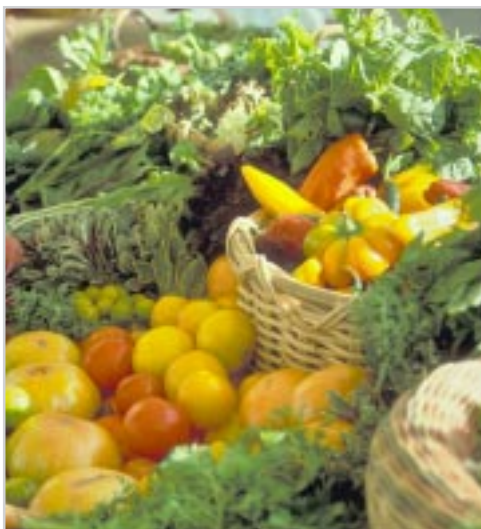
Search our new online library for information about specific crops, or search by publication title or subject matter.

After reading selected abstracts, users may request a complete copy of an article by filling out the online re-