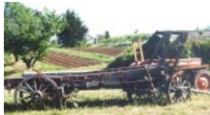
Historically, farm subsidies have been distributed primarily to the country's grain growers.