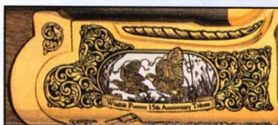
Left side of Receiver