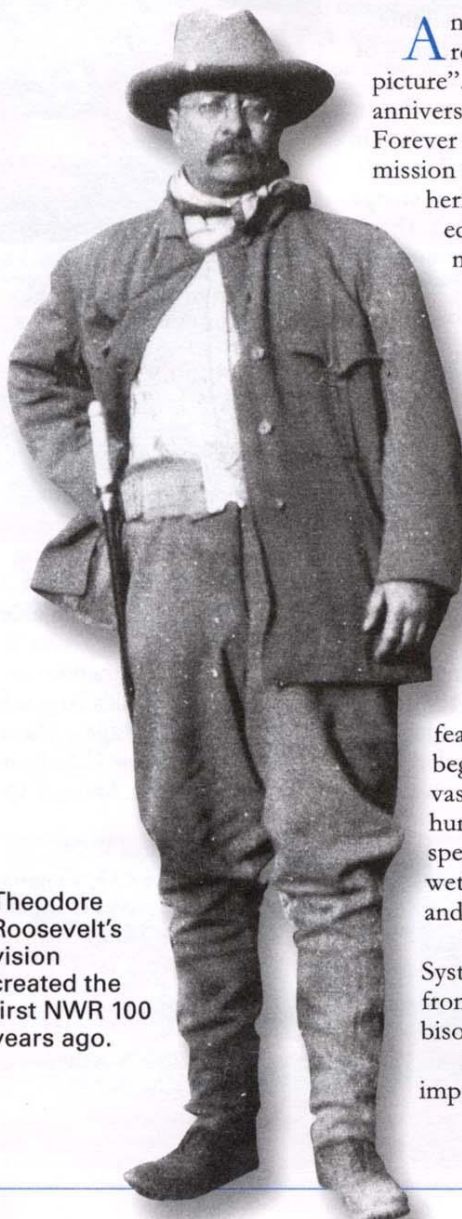
Theodore Roosevelt's vision created the first NWR 100 years ago.

Anniversaries offer a chance for reflection, for considering the “big picture”. Celebration often accompanies anniversaries and during 2003, Wildlife Forever marks 15 years of pursuing the mission of conserving America’s wildlife heritage through conservation education, preservation of habitat, and management of fish and wildlife.