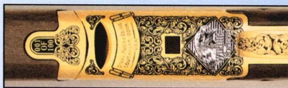
Underside of Receiver