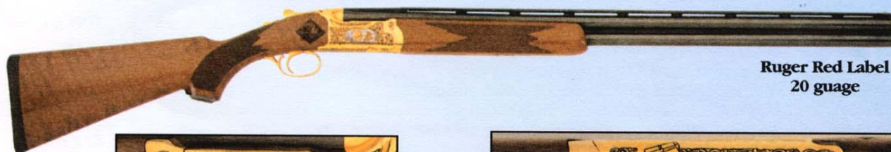
Ruger Red Label 20 gauge

For more information, call Pete Wuebker at Wildlife Forever: (763) 253-0222 or send an e-mail to: pwuebker@wildlife forever.org . Include your mailing address.