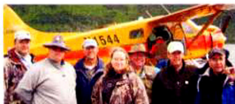
Participants of the 2003 Kodiak Life Member/VIP trip.

Educational and interesting it was also great fun and . . . YOU'RE INVITED! To add your name to the list of future A-Team members for exciting destinations drop us a line at ATTN: America's Great