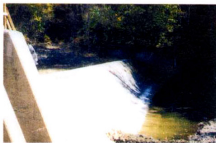
Before removal, the Old Berkshire Mill Dam obstructed the flow of the Housatonic River in Dalton, MA.

This innovative project to remove the aging dam was the first of its kind in Massachusetts. It was discovered that the Old Berkshire Dam was leaking around the spillway and needed repair. Since the dam served no purpose, it was decided to take the more habitat friendly approach and remove it. As no dam in the state had ever been decommissioned, no state regulations existed to facilitate the process. Project participants endured a long planning and permitting process that involved multiple state agencies to achieve