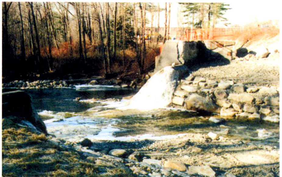
The East Branch of the Housatonic River now flows freely for the first time in almost 100 years.

a consensus favoring local fish and wildlife.