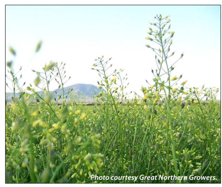
Camelina grows in a Montana field.

Specialty Olive Oil Production www.sfc.ucdavis.edu/pubs/SFNews/archive/94111.htm