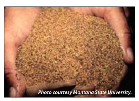
Camelina seed is very small compared to other oilseeds.

quantities. The shelf life of oil is usually six to 12 months if it is properly packaged and kept away from heat and sunlight (Fellows and Hampton, 1992).