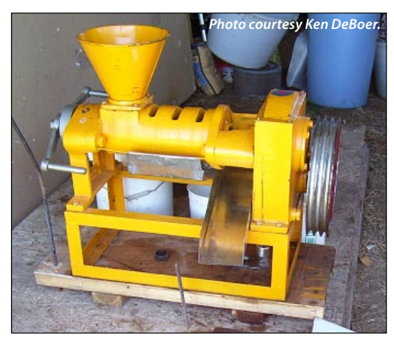
This 1-ton press was too small and slow for what its owner planned for it.

Choosing the correct size of press for what you intend to do is very important. For example, Montana farmers' experiences led to the conclusion that 1-ton per day presses