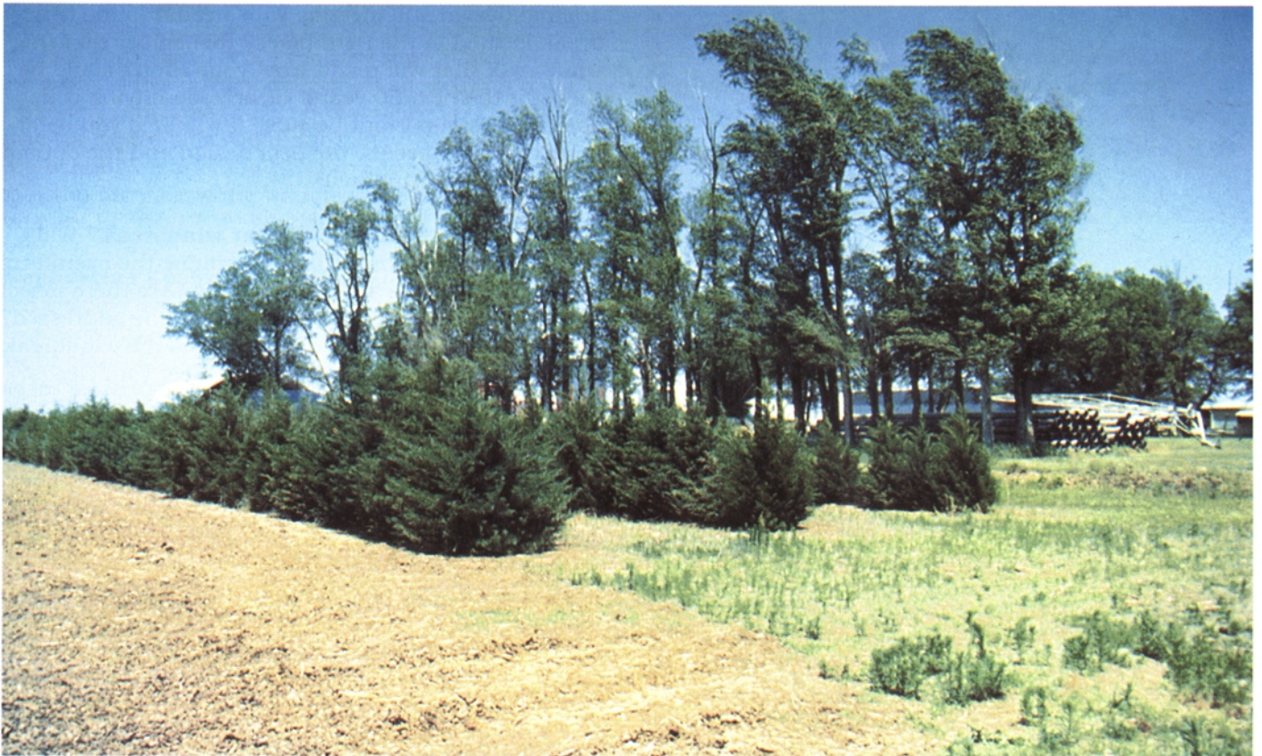
Three rows of eastern redcedar were added to this farmstead windbreak providing protection from blowing snow. In several more years the remaining rows of Siberian elm should be removed and replaced with two or more rows of tall, deciduous trees such as green ash, hackberry or oak.

There are many techniques available. This guide is designed to provide a step-by-step approach for restoring the effectiveness of your windbreak. With careful planning and follow-through, renovation of your windbreak should lead to the development of a healthy and functional windbreak.