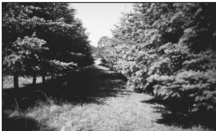
A single row Douglas fir silvopasture system. Pruning allows additional light under the trees and encourages forage production throughout the pasture.

The ability of recently forested land to grow trees can be predicted from performance of the previous stand. However, the ability of pasture or rangeland to support commercial timber production is harder to predict. Many forage plants are more shallowly rooted than are trees, and a very productive pasture may have soils which are too thin or seasonally too wet to support commercial tree production. Since soils can change significantly over very small distances, the presence of the desired tree species near the proposed silvopasture site is no guarantee of successful tree establishment and growth. Local County Extension and the Natural Resources Conservation Service offices are good sources of information about soil suitability for specific pasture and tree species.