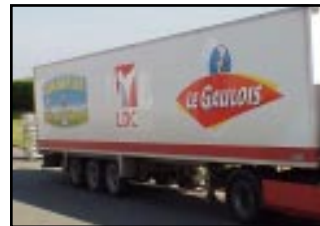
Label Rouge processed birds are trucked to market (above, right) by poultry co-ops. At left above, they are displayed in a supermarket.

founded in 1965 as a grassroots organization for small family farms interested in marketing poultry. The system has grown to thirty-eight production and marketing organizations that represent nearly seven thousand farmers, and two hundred and sixty firms such as feed suppliers, hatcheries, processors and distributors."