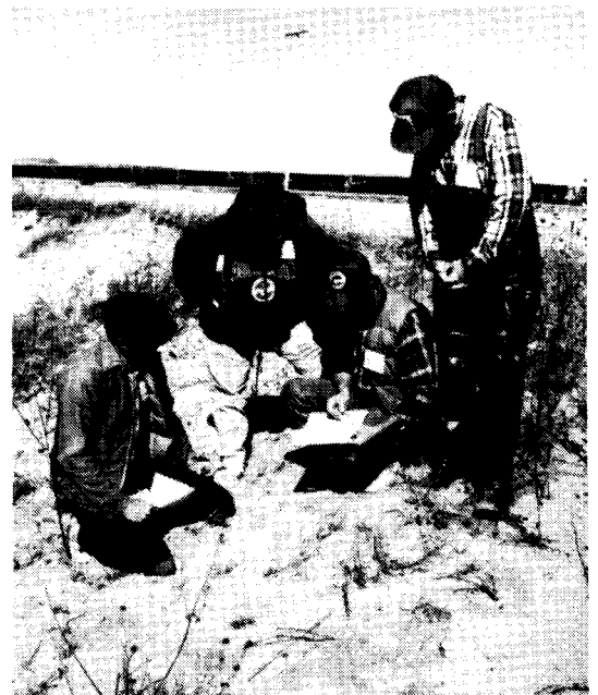
Participants at a workshop on soil bioengineering take streambank slope measurements.

Agroforestry, in the United States, in its purest sense, is still young. Consequently, the application potential for agroforestry faces an interesting dichotomy. On the one hand, the application of agroforestry is dependent upon marketing the concepts. On the other hand the marketing of agroforestry is dependent upon the successful application of scientific principles. Striking a balance between these two variables will largely dictate the future of agroforestry practice in America.