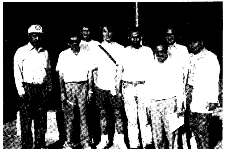
The Agroforestry Center regularly hosts visitors from other countries. Visitors take home information and techniques to apply to their country and NAC gains knowledge about different agroforestry techniques.