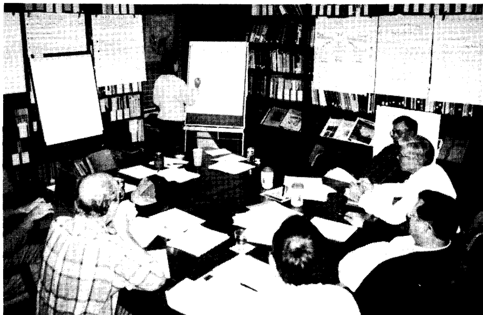
The design team plans a new in-service training course on "Agroforestry: A Conservation Planning Opportunity." The first course is tentatively scheduled for October, 1997.