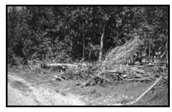
Properly planned, waterbreaks can effectively trap flood debris.