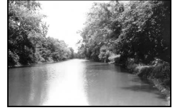
Trees along this streambank will effectively control bank and surface erosion.