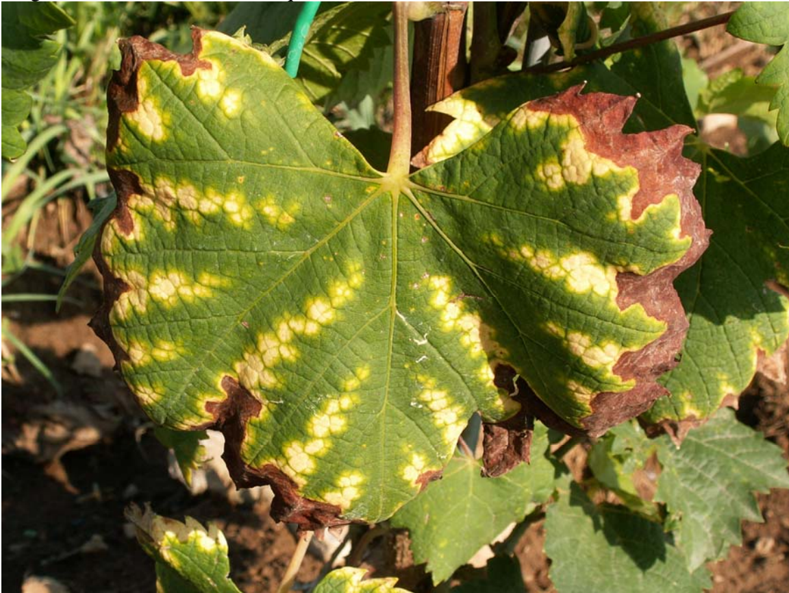
Figure 3. Magnesium deficiency in a Kentucky vineyard.

Magnesium is deficient if the petiole test is below 0.14%. If soil pH is below 6.5 then dolomitic limestone application at the recommended rates can fix the problem. If the soil pH is within the normal range for the cultivar 300 to 400 lbs/acre of magnesium sulfate application to the soil, or 10 lbs/acre of foliar spray of magnesium sulfate is recommended. Magnesium is below normal if petiole test is 0.15 to 0.25%. In this case, if the soil pH is below 6.5 then dolomitic limestone application at the recommended rates can fix the problem. Or, application of magnesium sulfate to the soil at a rate of 200 to 300 lbs/acre or a foliar application of 10 lbs/acre is recommended. Magnesium in the vineyard is at normal levels if the petiole test is 0.26 to 0.45%. Application of Magnesium fertilizers are not required.