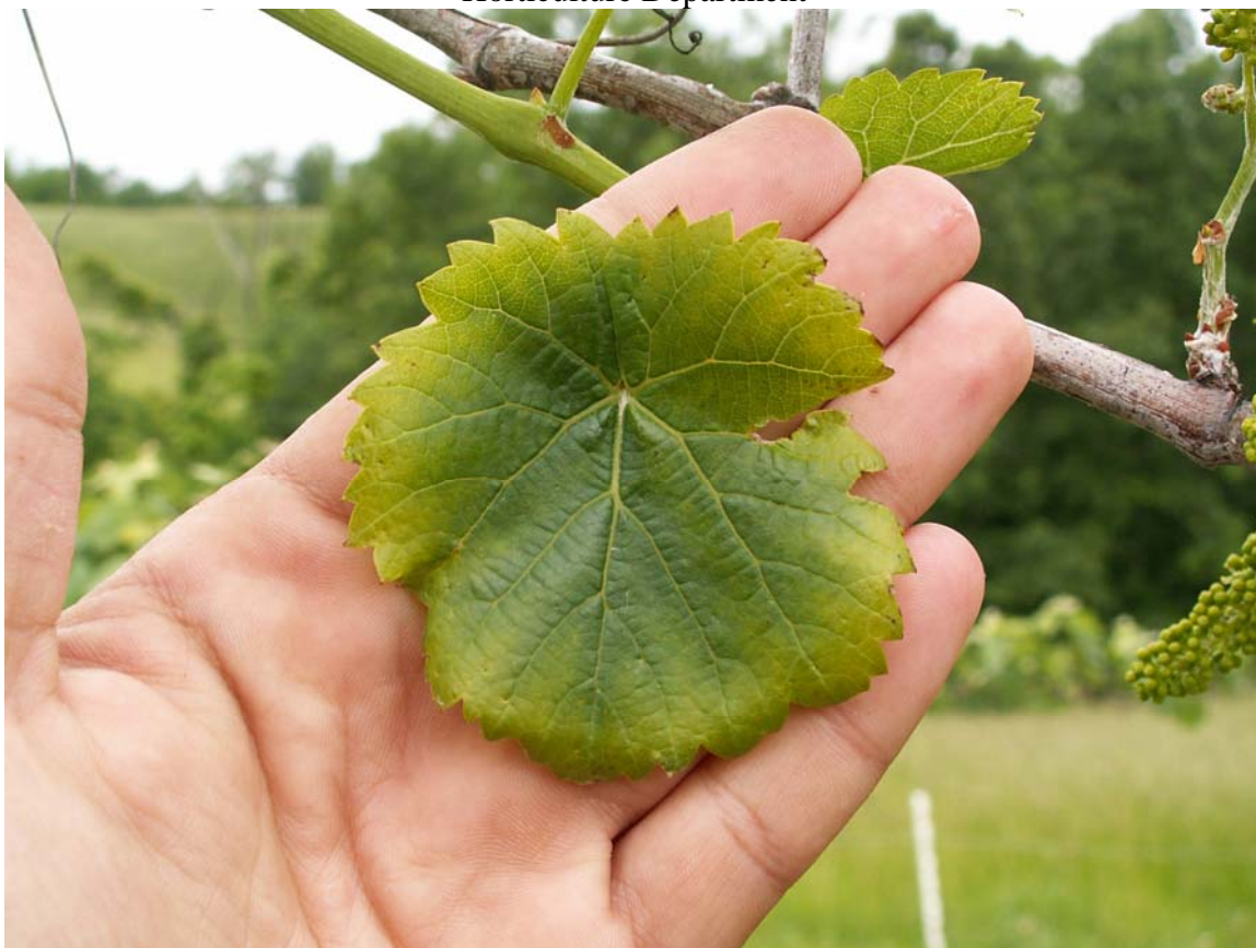
Figure 2. Potassium deficiency in young ‘Traminette’ leaf in Kentucky.

Potassium compounds tend to be fixed in the soil surface, although less than phosphate. This fixation, which makes potassium unavailable to plant roots, generally is greater in a clay soil with pH near 7.0 than in a sandy soil with a pH near 5.0. Therefore, potash application rates may need to be greater and more frequent on clay than on sandy loam soils, especially if the pH is above 6.5. If foliar sprays are indicated, use a solution containing 6 to 10 pounds of either fertilizer per 100 gallons. Apply at a rate of 200 to 300 gallons per acre of mature vineyard. Foliage applications are of primary value, but they provide only a temporary solution to a potassium problem. Soil applications have a more lasting effect. Make one or more applications as soon as the need is determined. Avoid excessive rates of potash, which can lead to magnesium deficiencies in the vineyard and high pH must and wine. Potassium is deficient in the vineyard if the petiole test is below 0.5 to 1.0%. In this case 500 lbs of sulfate or muriate of potash needs to be applied per acre. Potassium is below normal if the petiole test is 1.1 to 1.4%. In this case 400 lbs of sulfate or muriate of potash needs to be applied per acre. Potassium levels are normal if the petiole test is 1.5 to 2.5% according to the petiole tests. In this case potassium application can be optional but a maintenance application of 200 lbs of sulfate or muriate of potash is recommended.