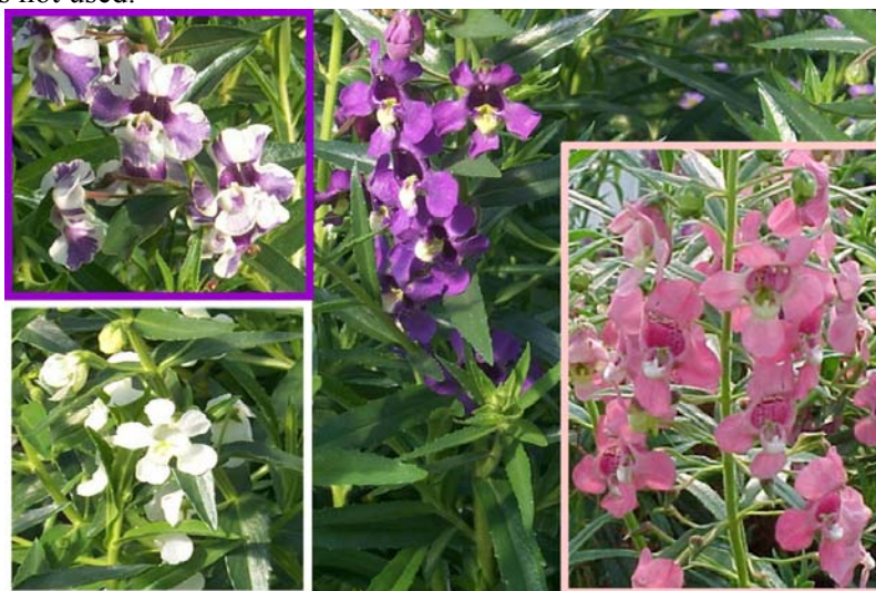
Figure 1. Angelonia AngelMist cultivars 'White', 'Purple Stripe', 'Purple' and 'Pink'.

Angelonia has relatively high cut flower yields; an average yield of 78 stems ft 2 for approximately 20 weeks of greenhouse production. The cut stem production leads to relatively high returns for summer greenhouse cut flower production. At prices of only $.10/stem, gross returns would be $7.80 ft -2 ($84.10 m -2 ).