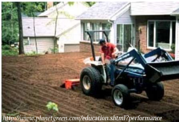
Tilling compost into soil during lawn renovation.

Compost application. Compost can be tilled into the soil during turf renovation, used as a topdressing, or sprayed on as compost tea. Solid compost can be applied as an unmixed material or mixed with sand for easier handling. The method of application depends on whether you want to improve soil quality, enhance soil fertility, or control pests and diseases.