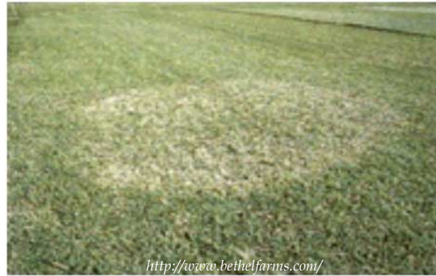
Brown patch disease can be controlled by the application of certain types of compost.

Characteristics of disease suppressive composts. The composition, age, and preparation methods of composts are keys to their providing disease suppressive benefits. Compost must be mature and fully cured to suppress diseases. Immature compost has a high concentration of ammoniac nitrogen ( \text{NH}_4 ) and increases, rather than decreases, the incidence of Fusarium diseases (39). Disease