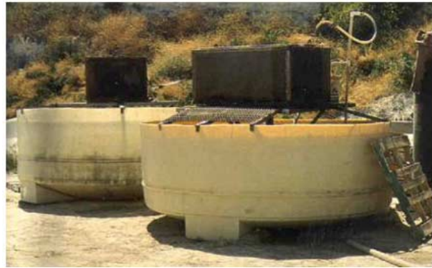
A compost tea brewing tank in California.

Compost tea. You can make anaerobic compost tea by soaking a burlap bag full of compost in a barrel of water for up to two weeks. Soaking for four to seven days at temperatures below 65° to 70° F provides the highest level of disease suppression (8). Aerobic compost is prepared in the same manner, except that the ratio of water to compost should be no more than 10 to 1, and the compost should be soaked in the water for no more than 48 hours. Another method for producing aerated compost is to add compost to a brewer or vat that has air bubbling through it. Both anaerobic and aerobic compost extracts protect against plant diseases (43). Research examining the effect of compost tea on golf greens found that treated grass had longer roots, fewer diseases, and higher density than untreated turf. For this study, compost tea was applied weekly to bi-weekly at the rate of one gallon per 1000 square feet (44). For more detailed information on the production and use of compost teas, see the ATTRA publication Notes on Compost Teas .