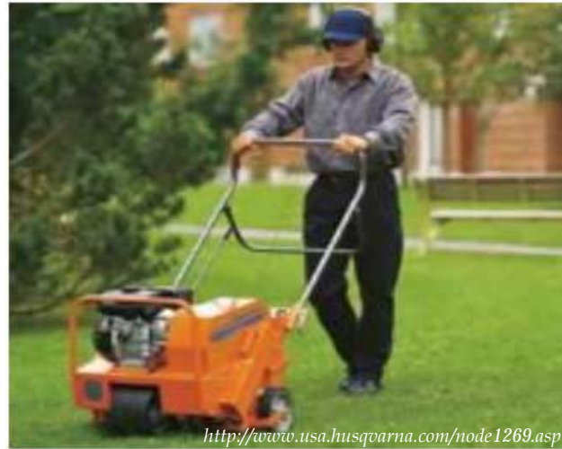
A professional aerator.

Following mechanical aeration, topdress compost onto the field or lawn. The topdressed compost will fall into the core holes, resulting in a partial incorporation of the compost into the soil. Mixing 40% compost with 60% sand produces a