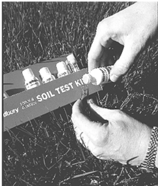
Illustration 2. Soil testing helps you provide your lawn with the correct amount of nutrients without risking contamination of the environment

Natural nutrients sources. While compost is an excellent natural nutrient source, its balance of nutrients may not be the same as those required for healthy turf growth. Consequently, you may occasionally need to apply more targeted nutrient supplements. Table 2 contains a list of nutrient supplements and their designation as organically approved, permitted, or prohibited. For additional information on soil amendments and organic fertilizers and where to obtain these products, see the ATTRA publications Alternative Soil Amendments and Sources of Organic Fertilizers and Amendments , respectively.