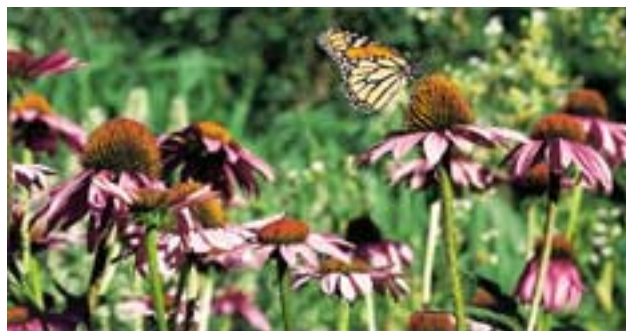
Illustration 4. Wildflowers add diversity to lawns.

Since many wildflower seeds are small, you have better control over their distribution if you mix them with compost, potting soil, or sand before broadcasting. Attempt to plant approximately fifteen to thirty seeds per square foot. This will ensure that there are enough plants to crowd out weeds without the wildflowers being so close together that they are not able to bloom (31, 33).