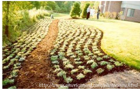
Recently laid wildflower turf.

Choosing and installing sod. Most sod contains high-maintenance grasses and is grown using synthetic inputs. If you use sod, try to choose one grown that uses compost and contains a mix-