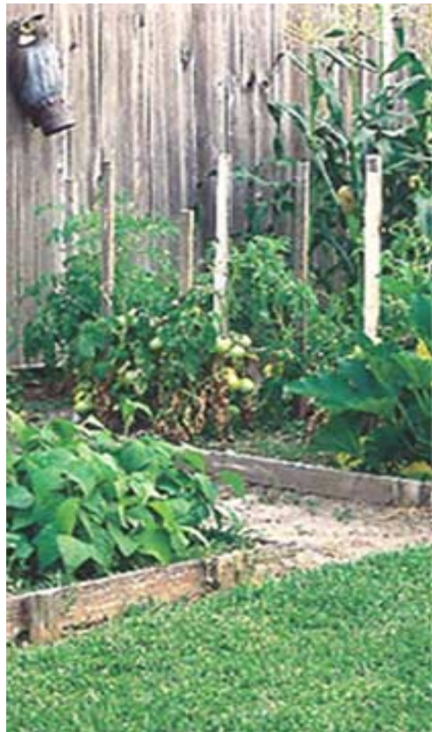
Illustration 1. A healthy lawn complements a healthy garden.