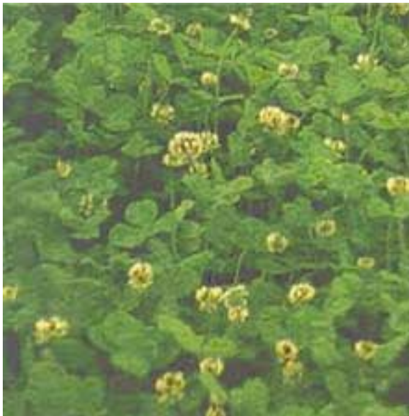
Illustration 3. Dutch white clover is an excellent addition to a mixed species lawn. ( http://www.ampacseed.com/clover1.htm )

In more arid or degraded landscapes, black medic is a good complement to turfgrass or wildflowers in a natural lawn. It can also serve as a temporary restoration crop to aid in turf establishment. Like clover, medic fixes nitrogen, helps aerate the soil with its deep root system, grows close to the ground, and is non-invasive (24).