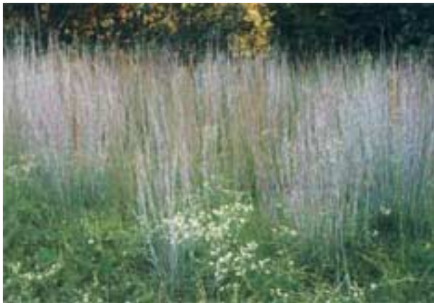
Illustration 5. Prairie grasses can add diversity and beauty to a natural lawn

Grasses, especially native warm-season prairie grasses, are a natural complement to wildflowers. The grass species little bluestem ( Andropogon scoparius ), sideoats grama ( Bouteloua curtipendula ), and indiagrass ( Sorghastrum nutans ) are excellent companions for wildflowers since they grow readily on almost any normal, well-drained soil, and can tolerate very dry conditions. In contrast, common lawn grasses – such as Kentucky bluegrass, tall fescue, and smooth brome grass – grow too aggressively to serve as good companions to wildflowers (31).