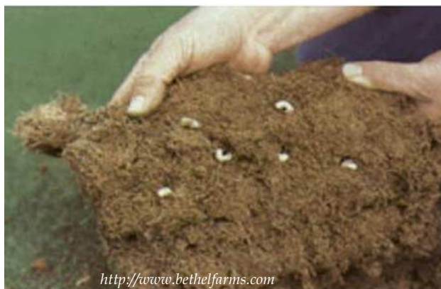
Grubs feeding on turf.

as well as pests. Pesticides also kill many soil organisms that decompose organic matter, form aggregates, and suppress diseases. As a result, pesticides may decrease insect infestations in the short term, but create other conditions that increase turf stress. Thus, turf managed with pesticides often has more pest problems and requires more intensive management than turf managed with biological products.