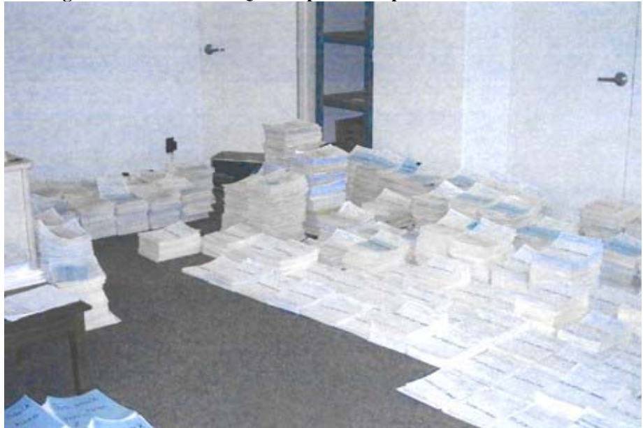
Figure 1: File Room for QAS Inspection Reports and GSA Form 139s