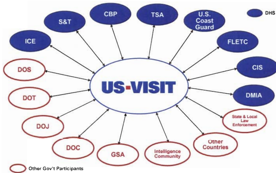
Figure C-3. US-VISIT Program Government Stakeholders

The involvement of this large number of stakeholders compounds the complexity of the Program. The time to coordinate increments of work as well as any changes to this work is significantly increased, and must be accounted for in the development of schedules. The Program must analyze the potential impacts of implementations that answer US-VISIT needs and ensure that these same implementations do not inadvertently cause any negative impact to the missions of other stakeholders. Finally, the implementation of US-VISIT Program initiatives must be coordinated with the other mission initiatives of the various stakeholders.