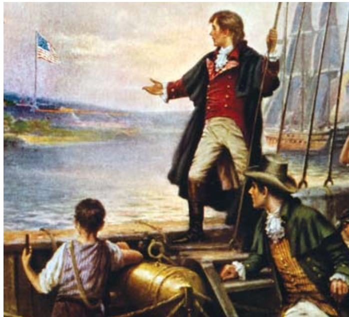
In “The Star-Spangled Banner,” by Percy Moran, Francis Scott Key reaches toward the flag flying over Fort McHenry.

In the United States, we celebrate Independence Day on July 4 to mark the anniversary of the adoption of the Declaration of Independence. After signing the Declaration of Independence, John Adams wrote to his wife, “I am apt to believe that it will be celebrated, by succeeding Generations, as the great anniversary Festival.” The Declaration of Independence, written by Thomas Jefferson, explained why the colonies had decided to separate from Great Britain. Americans celebrate the Fourth of July as the birthday of America, with parades, fireworks, patriotic songs, and readings of the Declaration of Independence.