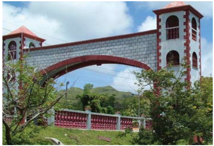
Old Spanish Bridge in Umatac, Guam.

The northern border of the United States stretches more than 5,000 miles from Maine in the East to Alaska in the West. There are 13 states on the border with Canada. The Treaty of Paris of 1783 established the official boundary between Canada and the United States after the Revolutionary War. Since that time, there have been land disputes, but they have been resolved through treaties. The International Boundary Commission, which is headed by two commissioners, one American and one Canadian, is responsible for maintaining the boundary.