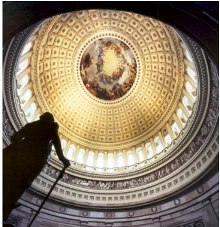
The Rotunda of the U.S. Capitol.

Congress is divided into two parts—the Senate and the House of Representatives. Because it has two “chambers,” the U.S. Congress is known as a “bicameral” legislature. The system of checks and balances works in Congress. Specific powers are assigned to each of these chambers. For example, only the Senate has the power to reject a treaty signed by the president or a person the president chooses to serve on the Supreme Court. Only the House of Representatives has the power to introduce a bill that requires Americans to pay taxes.