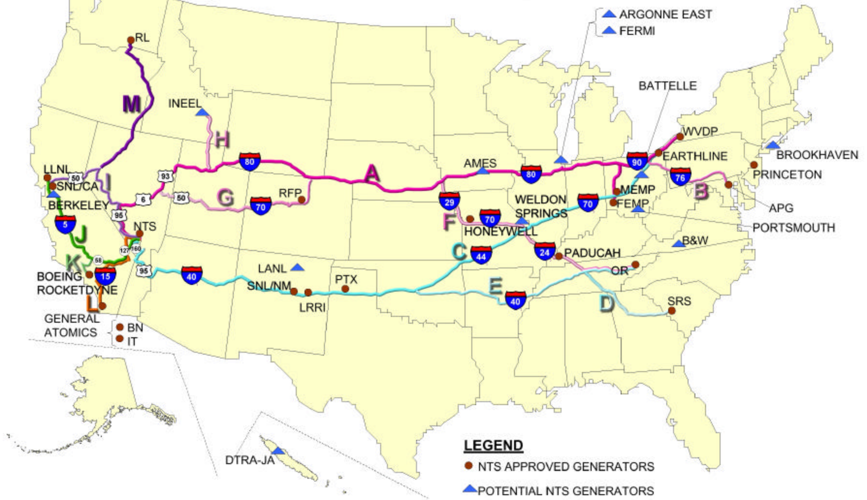
Figure 1 National Low-Level Waste Transportation Routes