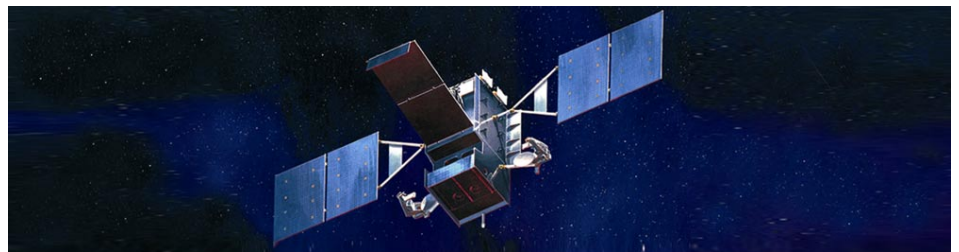
Illustration of geosynchronous earth-orbiting satellite

However, the restructuring did not fully address some long-standing problems identified by the Independent Review Team. As a result, the program continues to be at substantial risk of cost and schedule increases. Key among the problems is the program’s history of moving forward without sufficient knowledge to ensure that the product design is stable and meets performance requirements and that adequate resources are available. For example, a year before the restructuring, the program passed its critical design review with only 50 percent of its design drawings completed, compared to 90 percent as recommended by best practices. Consequently, several design modifications were necessary, including 39 to the first of two infrared sensors to reduce excessive noise created by electromagnetic interference—a threat to the host satellite’s functionality—delaying delivery of the sensor by 10 months or more. Software development underlies most of the top 10 program risks, according to the contractor and the SBIRS High Program Office. For example, testing of the first infrared sensor revealed several deficiencies in the flight software involving the sensor’s ability to maintain earth coverage and track missiles while orbiting the earth. Program officials stated that they are coordinating the delivery of the first sensor with the delivery of the host satellite to mitigate any schedule impacts, but they agreed that these delays put the remaining SBIRS High schedule at risk.