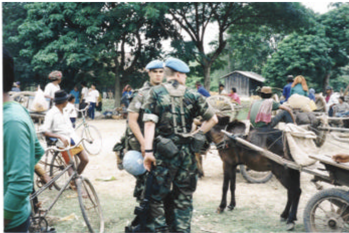
UN troops in Cambodia