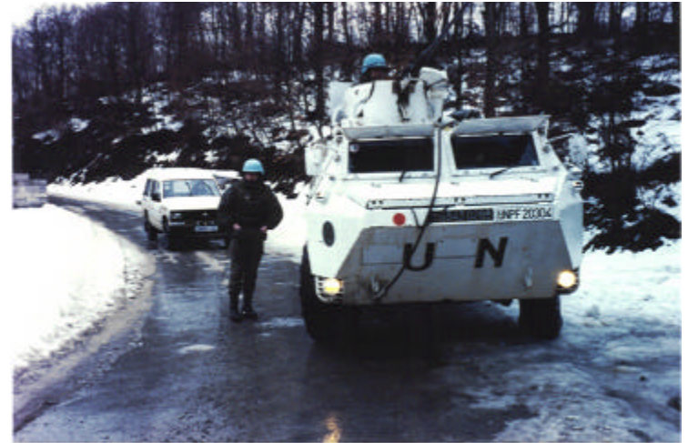
UN patrol in Bosnia