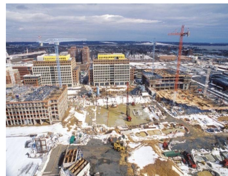
The U.S. Patent and Trademark Office (PTO) Construction Project in Alexandria, VA (February 2003)