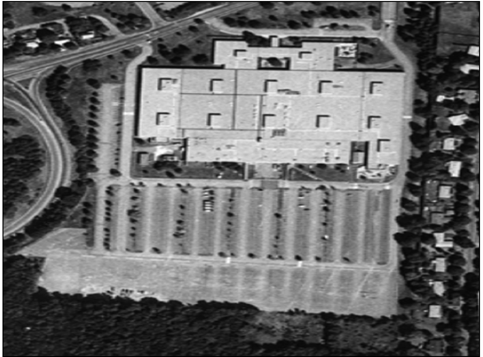
Figure 4: IRS Service Center, Andover, Mass.