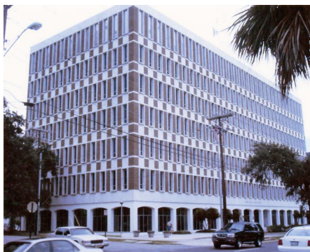
The Vacant L. Mendel Rivers Federal Building, Charleston, S.C.

Resolving these problems will require high-level attention and effective leadership by both Congress and the administration. Also, because of the breadth and complexity of the issues, the long-standing nature of the problems, and the intense debate that will likely ensue, current structures and processes may not be adequate to address the problems. Thus, as we have reported, there is a need for a comprehensive, integrated transformation strategy for real property that will focus on some of the underlying causes that contribute to these problems, such as competing stakeholder interests in real property decisions; various legal and budget-related disincentives to businesslike outcomes; inadequate capital planning and the lack of governmentwide focus on real property issues. It is equally important that Congress and the administration work together to develop and enact needed reform legislation to give real property-holding agencies the tools they need to achieve better outcomes. This would also foster a more businesslike real property environment and provide for greater accountability for real property stewardship.