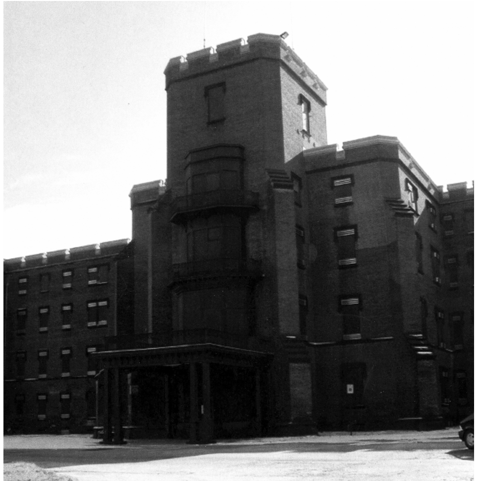
Figure 2: The Vacant Center Building, St. Elizabeths Hospital, District of Columbia