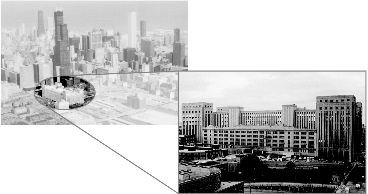
Figure 3: The Former Main Post Office in Downtown Chicago