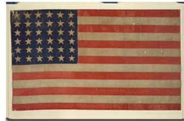
Thirty-six star flag. Created between 1864 and 1867.

http://www.loc.gov/teachers/tps/newsletter/pdf/Fall2008ElementaryLevelLearningActivity.pdf