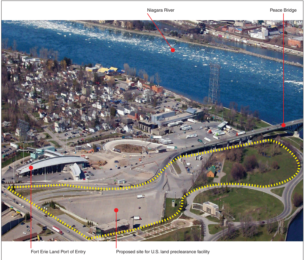
Figure 3: View of Fort Erie, Ontario, Canada Land Port of Entry