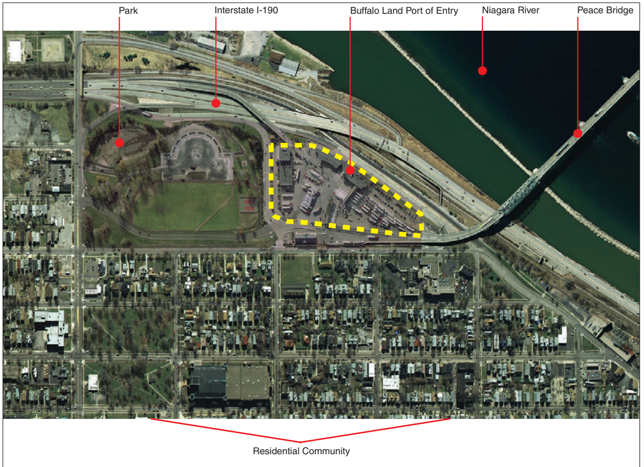
Figure 1: Overhead View of Buffalo Land Port of Entry