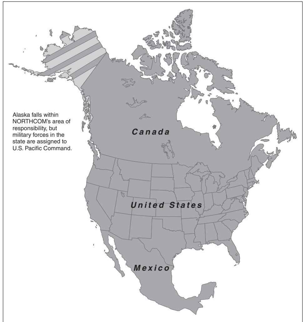
Figure 1: NORTHCOM's Area of Responsibility