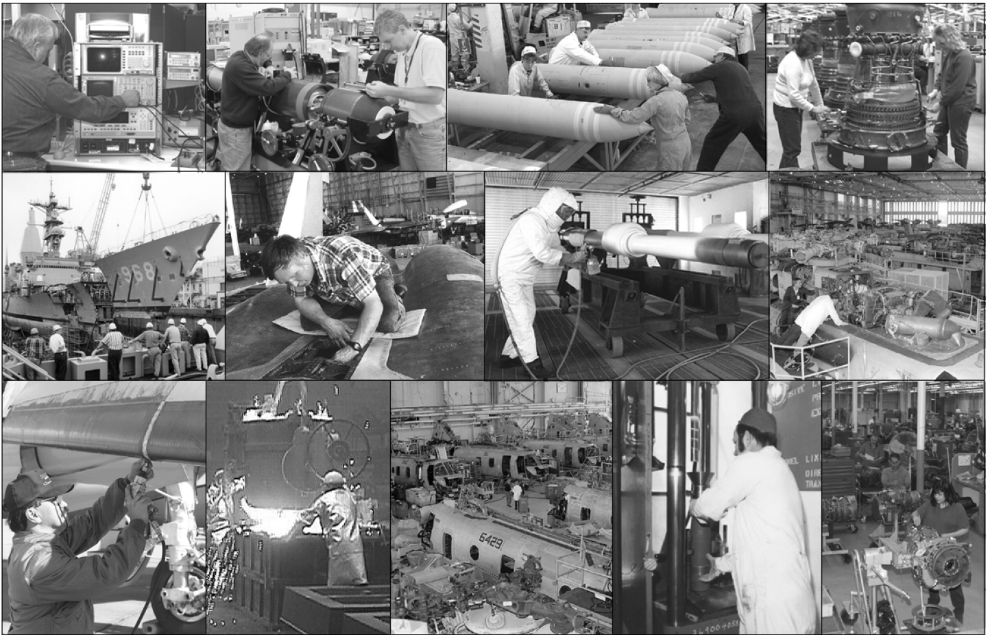
Figure 2: Collection of Various Maintenance and Manufacturing Activities Performed in Selected Industrial Activities