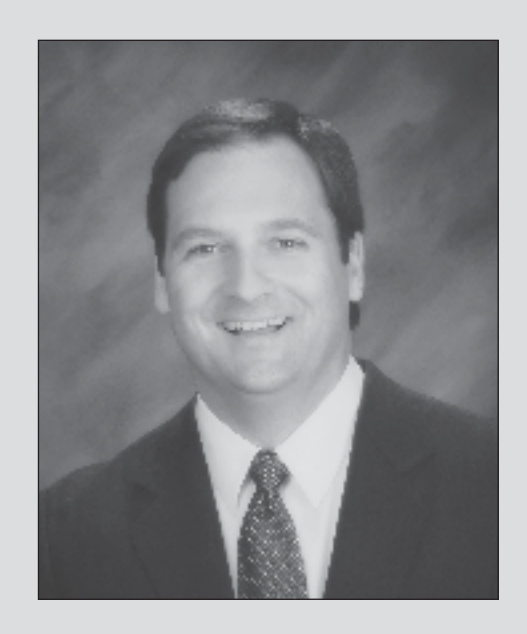
Democrat — 10