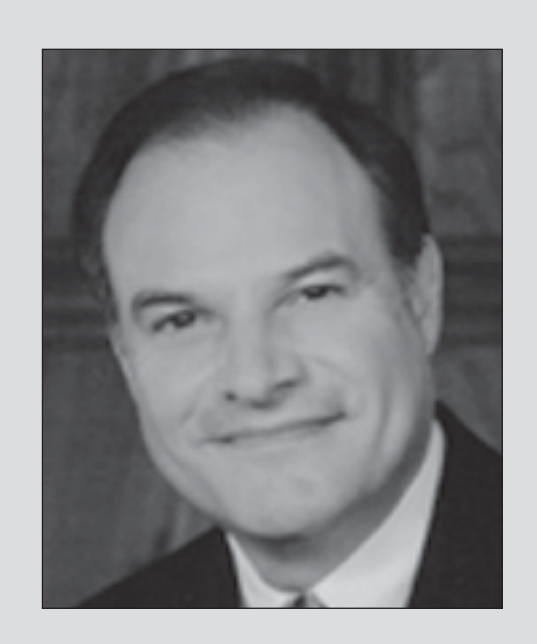
Democrat — 22