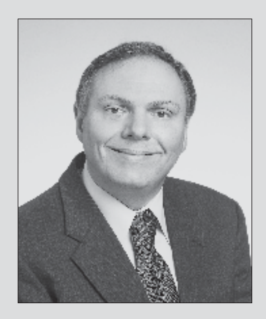
Republican — 1