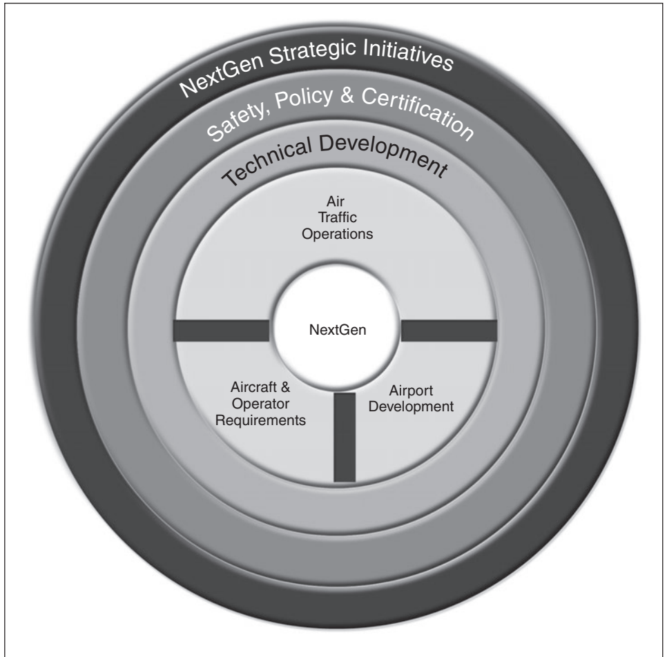
Figure 3: New OEP Framework