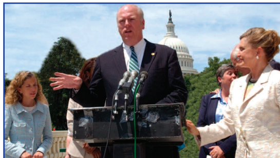
Crowley is joined by Congresswoman Carolyn Maloney and Congresswoman Debbie Wasserman Schultz at a press conference to discuss the fight for increased funding for breast cancer research

"My mother is a breast cancer survivor, and I am grateful that as a member of Congress I can represent her voice and the voices of all of the women who have faced breast cancer. As a vocal advocate for increased funding, research and treatment options for breast cancer, and I am committed to making sure this is a priority in Congress."