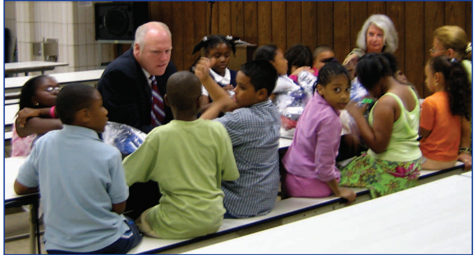
Congressman Joseph Crowley speaks with elementary school students at PS 178 Elementary School in Co-op City about the importance of wearing a helmet when riding a bike

In June, Congressman Joseph Crowley hosted the 1st Annual Bike Helmet Safety Day with PS 178 elementary school to promote bike safety for elementary school children. He partnered with Jacobi Medical Center to sponsor an essay contest and together they awarded bike helmets to the student winners. In a populous neighborhood like Co-op City, Congressman Crowley is committed to not only improving infrastructure and roadways, but also keeping the community safe.