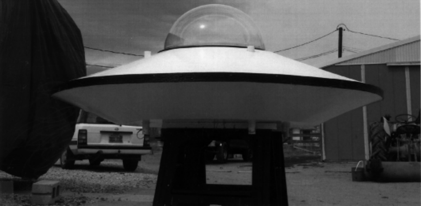
VIEW OF BOTTOM