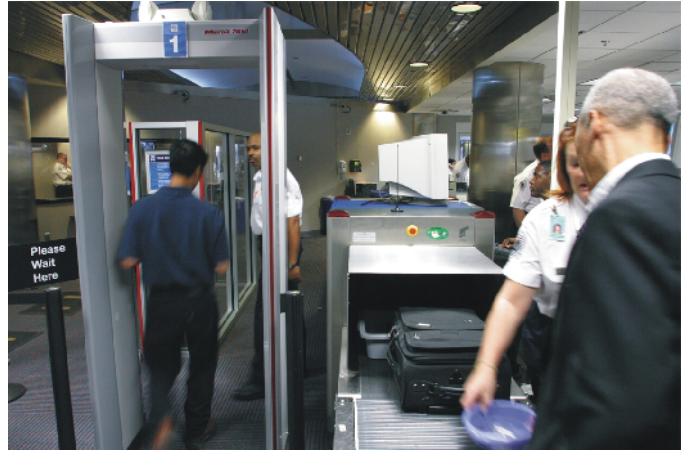
Passenger screening is more efficient and effective at every checkpoint in the country as a result of better training, pay, and improved accountability.