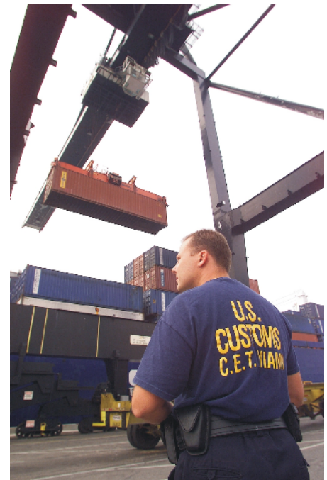
A customs inspector oversees the unloading of cargo containers from a ship at the Miami seaport.

Building on the border initiatives to date, the 2004 Budget includes $480 million to continue building a comprehensive system to track both the entry and exit of all visitors to the United States. In addition, about $120 million in new funding is provided to support technology investments along the border, including radiation detection machines to inspect cargo containers.