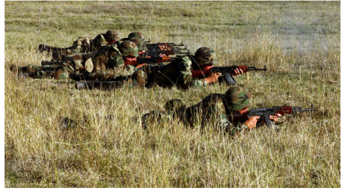
Georgian soldiers take aim in the Georgia Train and Equip Program.