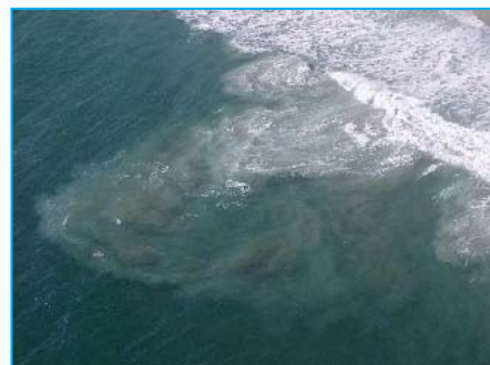
Rip currents often generate a plume of sediment moving away from shore.