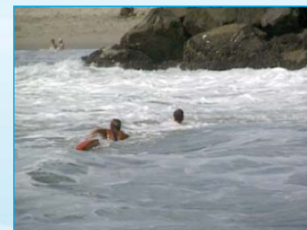
A lifeguard rescues a swimmer caught in a rip current.