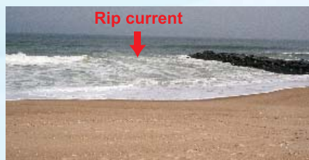
Rip currents often form near coastal structures.