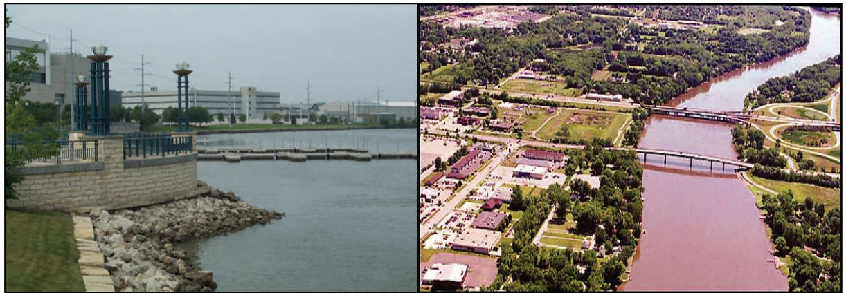
Communities like Moline, Illinois, with its new residential and commercial developments, will be able to take advantage of these new River Edge Redevelopment Initiatives.