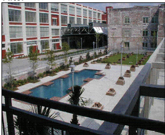
Projects like the American Can redevelopment into mixed-income housing can now take advantage of the Louisiana tax credits for site assessment and cleanup.