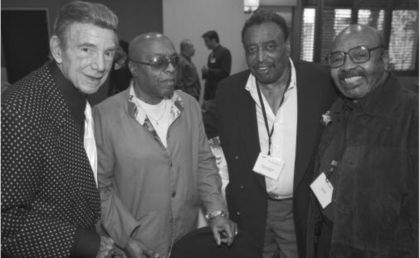
NEA Jazz Masters Louie Bellson, Roy Haynes, Chico Hamilton, and James Moody at the luncheon for the 2005 NEA Jazz Masters event in Long Beach, California.