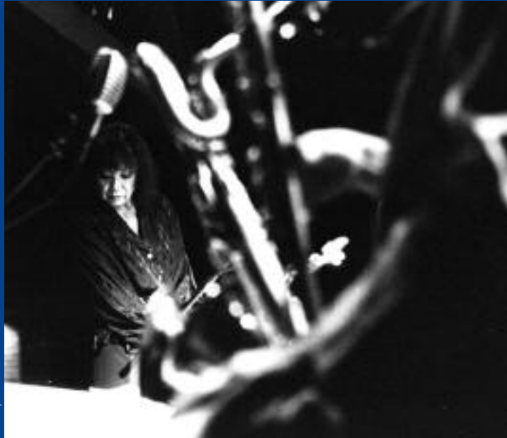
2007 NEA Jazz Master Toshiko Akiyoshi