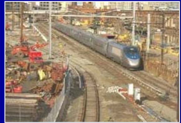
Amtrak Acela DC-NY: 83 mph avg.