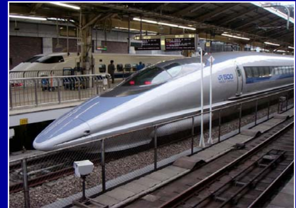
Japanese Bullet Train: 180+ mph