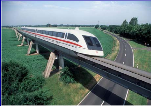
Maglev: 350 mph

U.S. Rep. John L. Mica Republican Leader, Committee on Transportation and Infrastructure