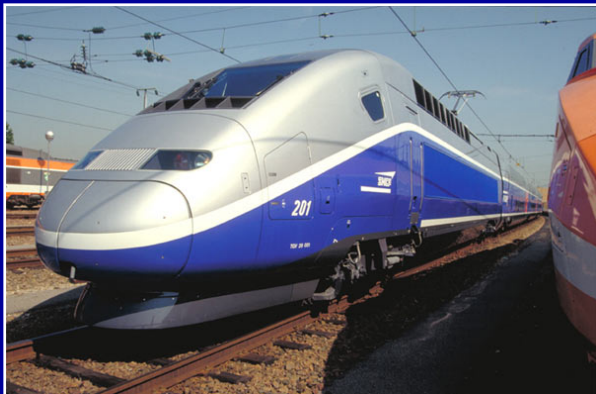
French TGV: 200+ mph