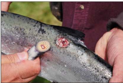
Sea lamprey and wounded coho salmon.

Sea lamprey, documented in Lake Ontario since the early 1800s, invaded the other Great Lakes after the Welland Canal between Lake Ontario and Lake Erie opened in 1920. Lampricide treatments are the mainstay of control and have reduced sea lamprey populations to levels that allow lake trout to survive to maturity in all five Great Lakes and to be fully self-sustaining in most areas of Lake Superior. Target ranges of sea lamprey abundance have been set by the Great Lakes Fishery Commission (GLFC) and fishery management agencies. Sea lamprey populations are still above target levels in all three upper Great Lakes and are increasing in abundance in Lake Michigan.