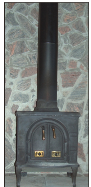
Wood stove.