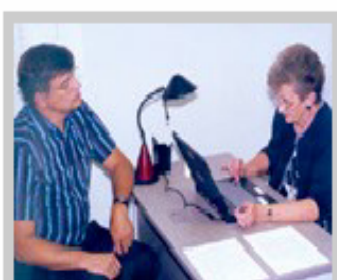
Asbestos Testing, Libby, Montana

Where health and the environment come together