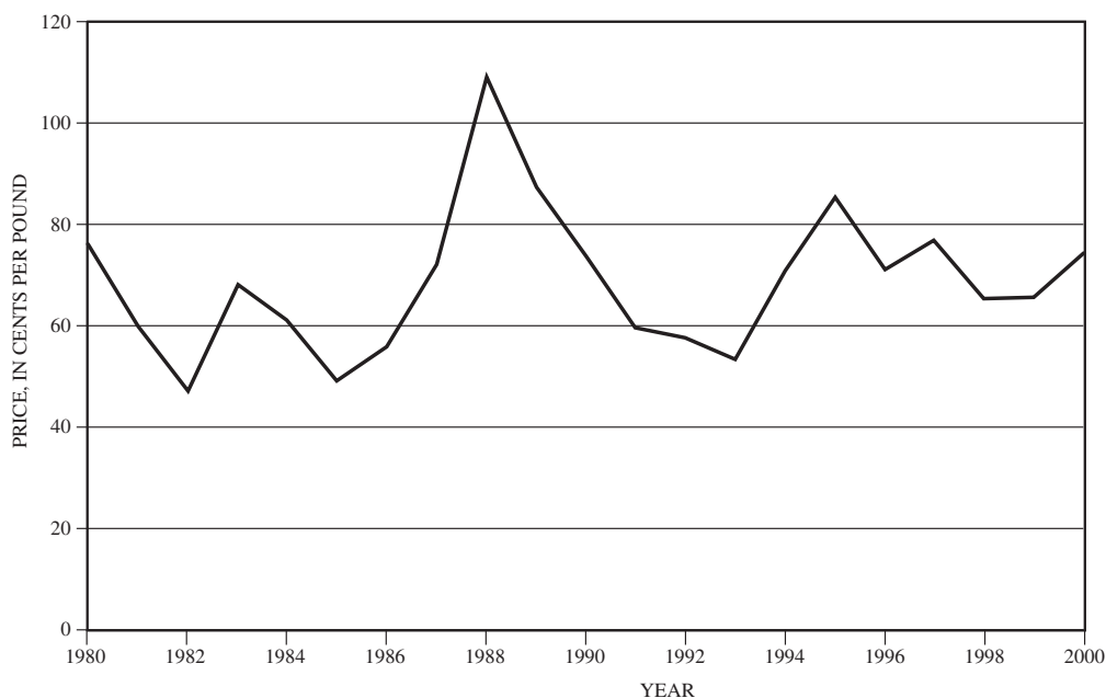
Figure 3. Annual average U.S. primary aluminum metal prices from 1980 through 2000.

The secondary aluminum industry started shortly before World War I at a time when the United States had only one primary aluminum producer. A secondary industry was not