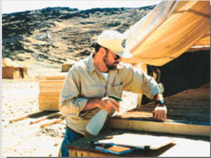
Examination of rock core, Ad Duwayah, Saudi Arabia

For more than 35 years, the USGS has maintained a mission in the Kingdom of Saudi Arabia under the auspices of the Ministry of Petroleum and Mineral Resources, and has worked cooperatively with the Deputy Ministry of Mineral Resources (DMMR). As part of an international effort to understand the geology and mineral resources of the Kingdom, USGS scientists have produced regional geologic maps, evaluated base-, precious-, and industrial-mineral deposits, and identified terranes and deposit model types not found in the United States. Knowledge gained by studying mineral deposits from around the world enables USGS scientists to better understand global mineral-resource issues as well as improving the Program's ability to carry out its domestic mineral-resource mission.