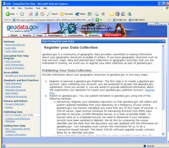
Help Center – Publishing Information

Once your account is created, log in to geodata.gov and select the Help Center tab. The Help Center provides information on how to register your data, how to create and publish metadata, data standards, links to metadata parsers, frequently asked questions, and much more.