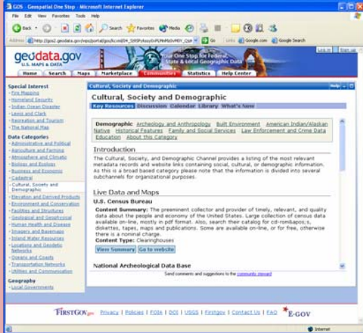
Communities Can Be Divided into Sub-communities

The Communities provide quick access to some of the most relevant data sets, applications, map services, and Web sites for the public without the need to search the entire portal.