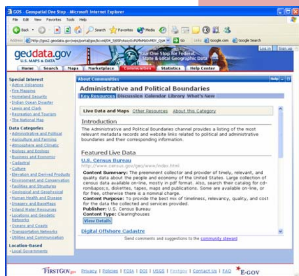
Communities Provide “Two Clicks” to Content