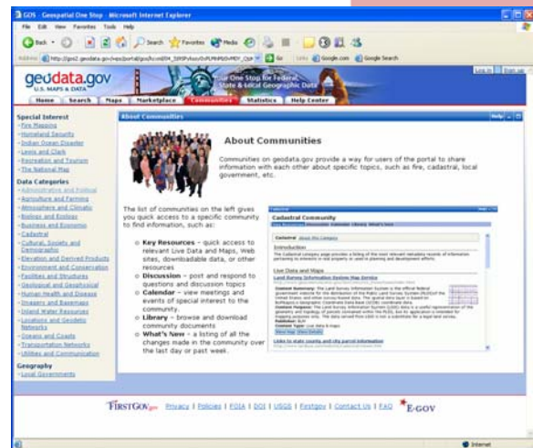
Communities Home Page

Communities may be added for local governments or for other areas of interest.