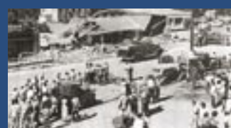
Residents of Tehachapi, Calif., fill the streets after the earthquake on July 25, 1952.

more than $26 million (1946 dollars) in damage (mostly in Hawaii). Number of deaths: 165 (all tsunami-related: 149 in Hawaii; 5 in Alaska; 1 in California)