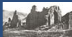
Taken in 1935, this image shows the ruins of the first La Purisima Concepcion Mission near Lompoc, Calif.