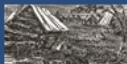
This 19th-century illustration depicts the damage and chaos resulting from the 1811-1812 New Madrid earthquakes.

Number of deaths: 41 (40 in the San Juan Capistrano collapse)