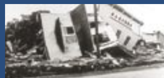
This political clubhouse in Hilo, Hawaii, was shattered by the earthquake-generated tsunami on April 1, 1946.