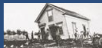
This home was damaged in the magnitude-6.9 earthquake on the Hayward Fault on Nov. 21, 1868.