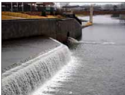
Urban runoff, Kansas City, Missouri.