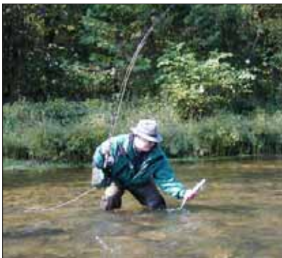
Recreational use, North Fork River, Missouri.