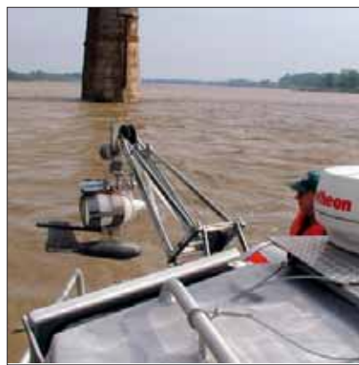
Figure 3. Use of a collapsible bag sampler on the Mississippi River at Thebes, Illinois.

Teflon bag (collapsible bag sampler) and the DH-81 hand-held sampler. The collapsible bag sampler typically is used where flow and depth conditions are too extreme to wade within the cross section. This sampler is suspended by a cable from either a bridge deck or a boat and lowered into the water at a constant rate (fig. 3). This 'transit rate' is calculated based on the depth and velocity of streamflow and the size of the nozzle attached to the sampler. The DH-81 sampler is used for small streams and during low-flow conditions where wading a cross section is safe. A transit rate is determined before sampling begins.