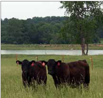
Agricultural use, Spring Creek Basin, Missouri.