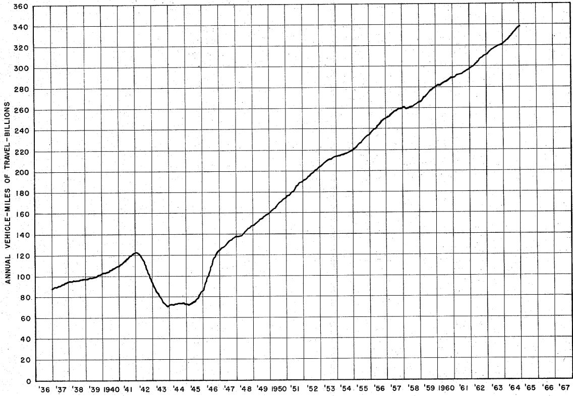
FIGURE 2--TRAVEL ON MAIN RURAL ROADS BY 12-MONTH PERIODS ENDING EACH MONTH, IN VEHICLE-MILES