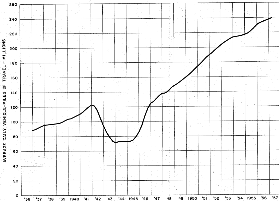
FIGURE 2—TRAVEL ON MAIN 1/2 RURAL ROADS BY 12-MONTH PERIODS ENDING EACH MONTH, IN VEHICLE-MILES