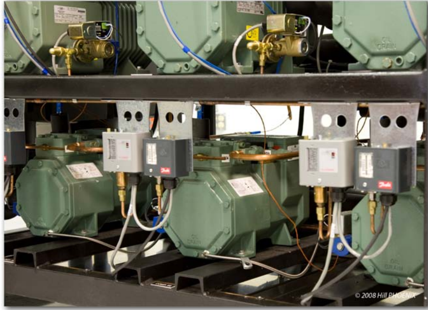
CO 2 Compressors on the SNLTX 2 Cascade System

But Price Chopper was looking for further innovations in its efforts to reduce energy consumption. In fact, says Martin, Price Chopper specified several innovations including “high-efficiency ECM fan motors and LED lighting in all cases, the use of reach-in door cases for all new medium-temperature loads, and variable-speed fan control for the air-cooled condensers. That quest for innovation is what ultimately led them to use our next generation SNLTX 2 low temperature refrigeration system.”