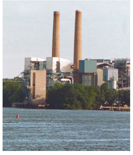
An uncertain future challenges water planners.

<sup>1</sup>U.S. Geological Survey (USGS), c/o National Oceanic and Atmospheric Administration (NOAA) Geophysical Fluid Dynamics Laboratory, Princeton, NJ 08540, USA. <sup>2</sup>USGS, Tucson, AZ 85745, USA. <sup>3</sup>Stockholm International Water Institute, SE 11151 Stockholm, Sweden. <sup>4</sup>USGS, Reston, VA 20192, USA. <sup>5</sup>Research Centre for Agriculture and Forest Environment, Polish Academy of Sciences, Poznań, Poland, and Potsdam Institute for Climate Impact Research, Potsdam, Germany. <sup>6</sup>University of Washington, Seattle, WA 98195, USA. <sup>7</sup>NOAA Geophysical Fluid Dynamics Laboratory, Princeton, NJ 08540, USA.