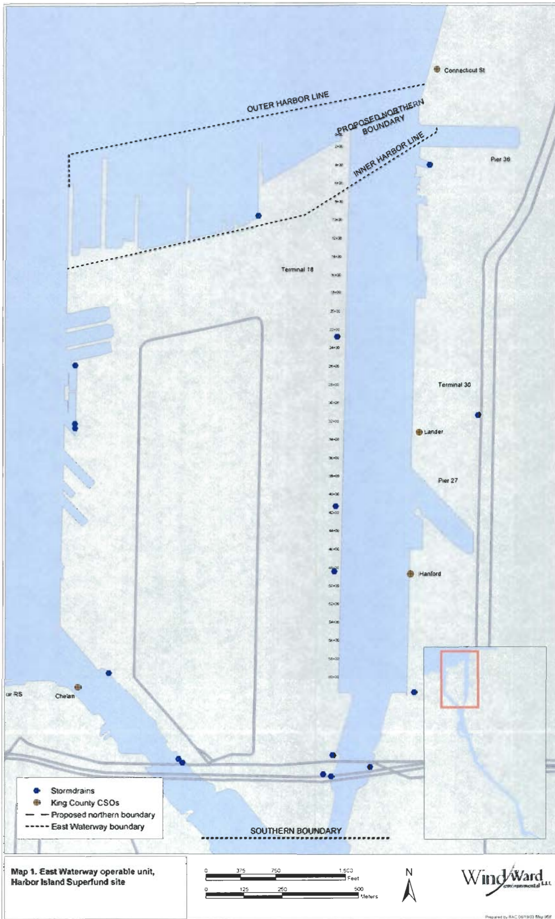
Map 1. East Waterway operable unit, Harbor Island Superfund site