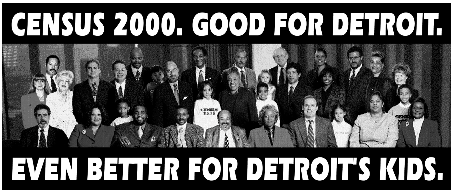
Figure 4: Detroit Billboard Showing Political Figures' Support of the Census