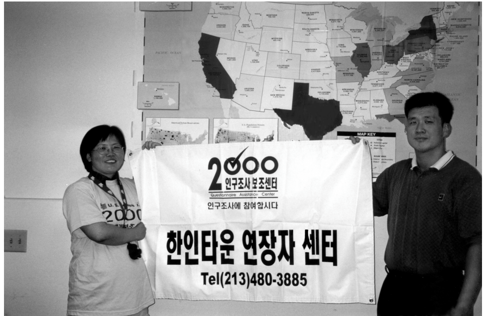
Figure 6: Korean Senior Center Banner With Tailored Census 2000 Questionnaire Assistance Center Logo