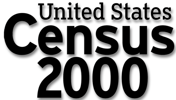
Figure 2: The Bureau's Logo as Downloaded From Its Web Site